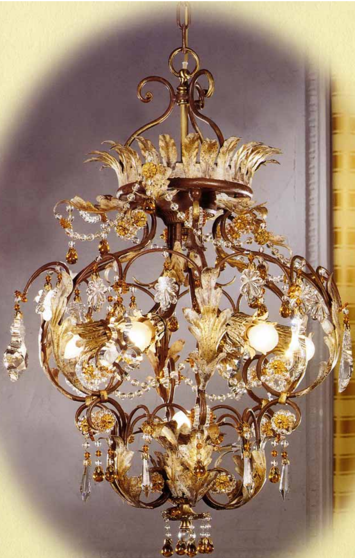
M 458/L Lampadario a 6 + 1 luci h 83 • Ø 55 cm Struttura in ferro policromo con cristallo bianco e ambra