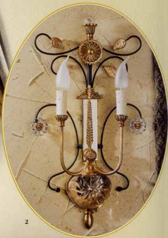
2. Wall lamp 2 lights Iron structure with brass details and crystals. E 14 - 2 bulbs x 40 W - Weight: 2 kg